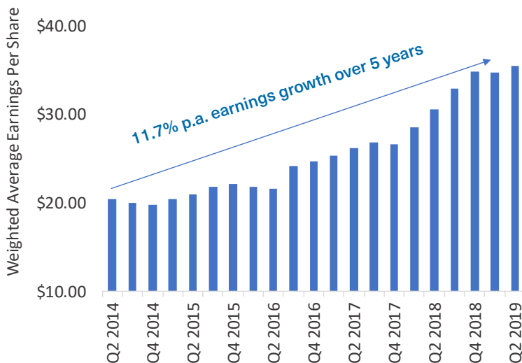
Strong Earnings Growth - S&P 500 Financials Index 1

In the US, stringent regulation of financial institutions is expected to be relaxed in coming years, providing additional opportunities for growth.