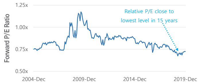
S&P 500 Financials Index Relative to S&P 500 Index Forward Price-to-Earnings 3

Based on price-to-earnings multiples ("P/E"), financial stocks are trading close to the lowest level in over 15 years relative to the S&P 500 Index.