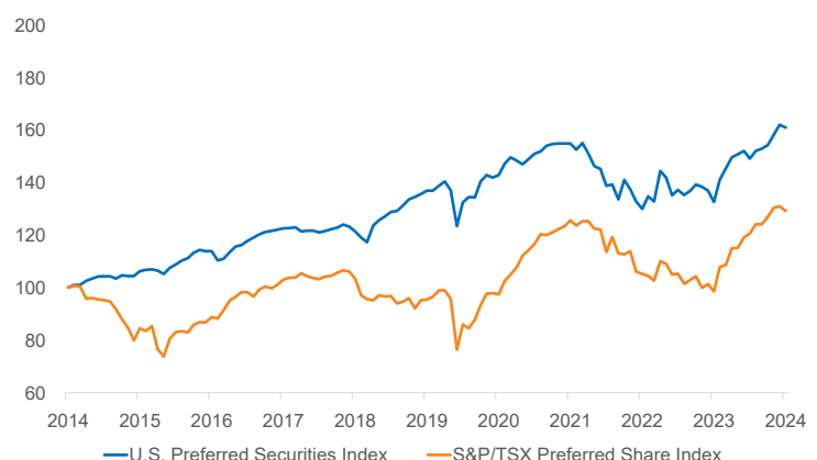
U.S. & Canadian Preferred Indices Total Return 3

U.S. preferred securities have historically outperformed Canadian preferred shares with lower volatility. 3