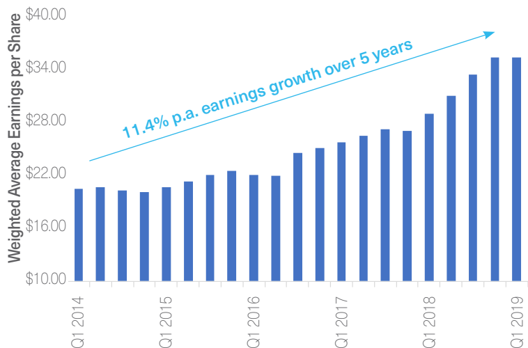
Improving Earnings - S&P 500 Financials Index 1

In the US, stringent regulation of financial institutions is expected to be relaxed in coming years, providing additional opportunities for growth.